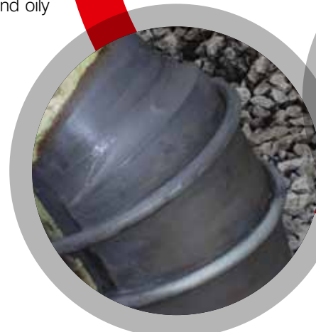
Cold Plate Bonding