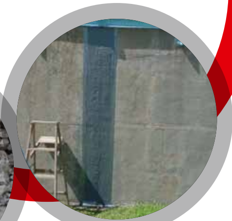
Sealing Leaking Tanks